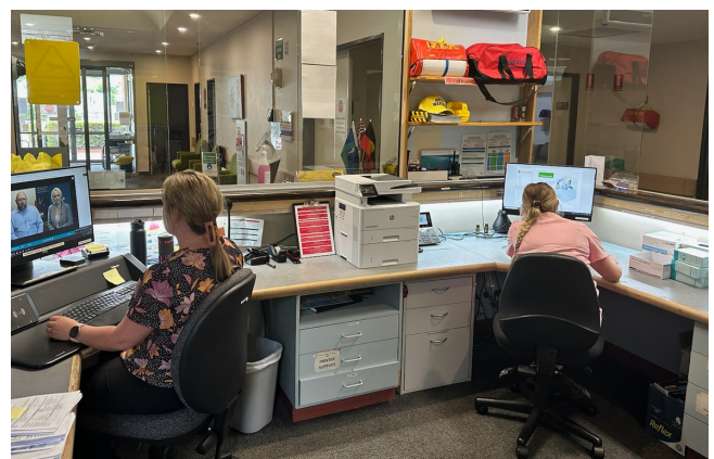
Beaufort Nursing Home and Hospital Staff completing their Mandatory Training courses