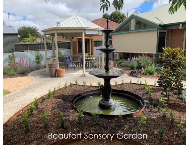
Beaufort Sensory Garden