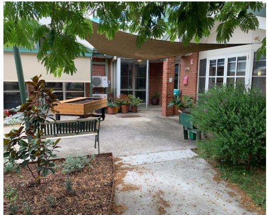
Beaufort Hostel Sensory Garden