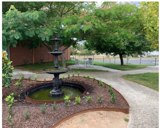
Skipton Nursing Home Sensory Garden