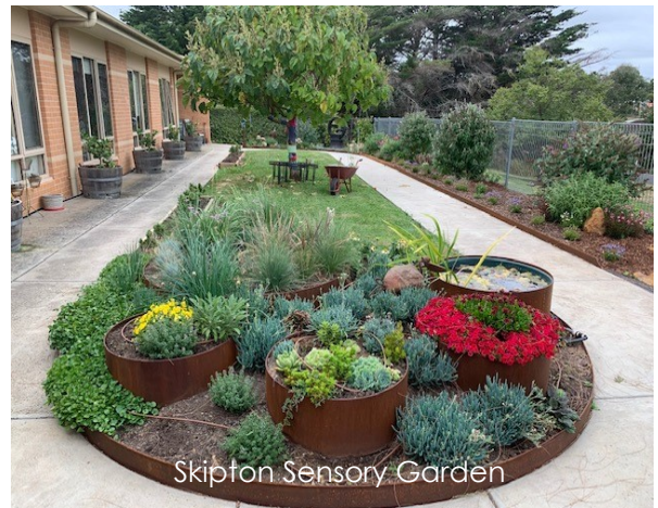
Skipton Sensory Garden

The Commonwealth has issued a request for tender to develop and deliver an evidence based Aged Care Transition to Practice Program. This program will assist graduate Registered Nurses by providing the support needed to develop their knowledge, skills and competence in the delivery of quality aged care services. The program needs to attract and retain new nurses into the aged care sector by offering access to important mentoring and training opportunities. The tender is valued at $7m over three years.